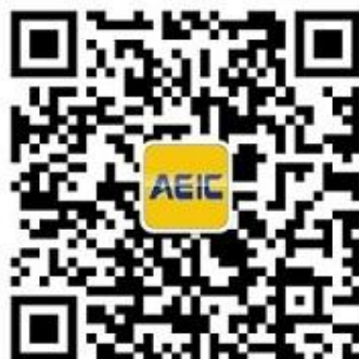
AEIC Official WeChat